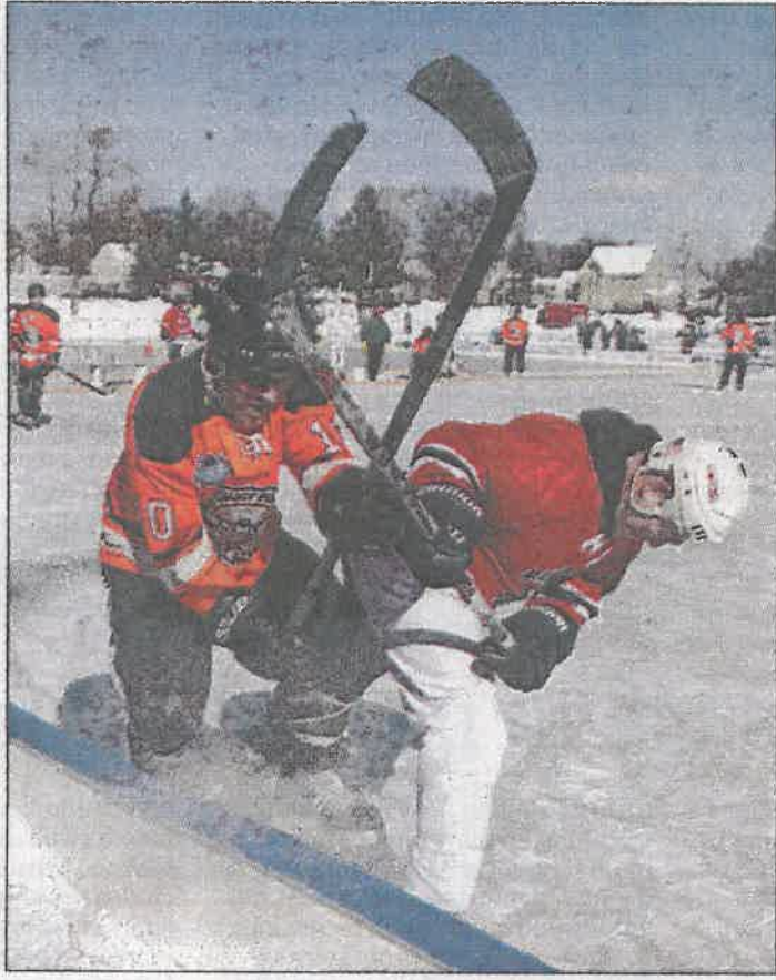
A scene from the Concord's Black Ice Pond Hockey tournament last year. The 2017 outdoor tournament was delayed two weeks to its backup date due to warm weather, and it's being pushed back this year for the same reason.

along with the original date. The tournament is in its eighth year. This is at least the third time Black Ice has been delayed due to warm weather. The event was pushed two weeks last year but otherwise carried on like usual, but, in 2012, even a two-week delay wasn't enough to prevent several games from being canceled due to slushy ice. Historically, Black Ice weekend weather has ranged all over the place. The weather hovered around - and sometimes dipped below - zero degrees during the 2013 and 2014 tournaments. In contrast, the temperature never went below 10 degrees, but often hung in the 30s, 40s and even once the 50s during the 2012, 2015 and 2016 events. Gill said all of the city's outdoor ice skating facilities are closed Monday. He expected them to be open again by Thursday afternoon, when the weather was supposed to get cooler, but may be closed again by the weekend. (Caitlin Andrews can be reached at 369-3309, c-andrews@cmonitor.com or on Twitter at @ActualCAndrews.)