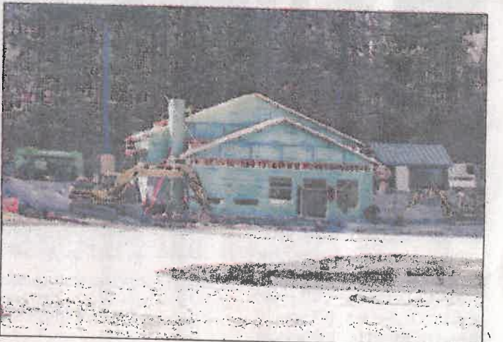
Monitor files Top left: Weather permitting, the Black Ice pond hockey tournament will be taking over White Park later this month. Top: Construction on the old Concord Theatre is ongoing with a completion date scheduled for April. Above: While it won't be ready for this skating season, the new skate house at White Park is expected to be done this spring.

The new performance venue will include seats for 300 people, while they can also convert the area to an open club setup for up to 450.